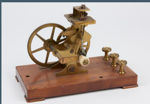
Telegraph machine from the 1850's

The iron press was invented by the end of the 18th century, and the first practical printing machine run with steam power was produced and put into use in 1814. As for conveyance and transport, the first practical steam carriage was constructed in 1802 and by 1824 several such vehicles were being used with considerable success. Daimler invented in 1885 the internal-combustion motor consuming petroleum spirit. The first steamship began to ply between Liverpool and Glasgow in 1815. The first railway line was opened in Great Britain in 1825. Electric telegraphy came into use in 1820 and communication between the various parts of the globe was thus very much accelerated. The first magneto-electric machine was devised in 1832.