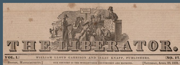
VOL-1 of the Liberator

In 1831 Garrison started the Liberator in Boston, which proved to be the beginning of an agitation that eventually pervaded and filled every part of the country. The Anti-Slavery Society was organised in 1833, and the Slave Emancipation Act, freeing all slaves throughout the British empire, came into force in 1834. As a result of this, thousands of slaves were emancipated at once. It looks very much like the custom of releasing prisoners and freeing slaves on the birth of a royal son.